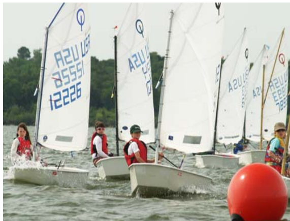
Juniors Racing Optimist Dinghies

All participants must provide a Coast Guard approved life jacket which also must fit properly. Participants are also responsible for: swim suits, tennis shoes, t-shirts, sunscreen, sunglasses, towel, hat, and water bottle.